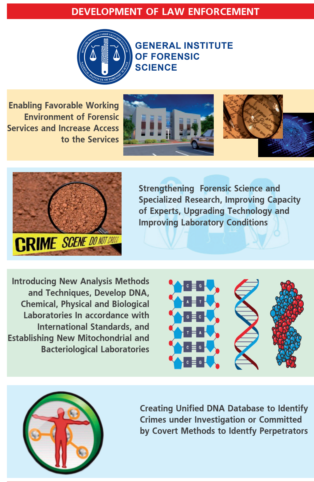
Figure 7.1 Development of Law Enforcement