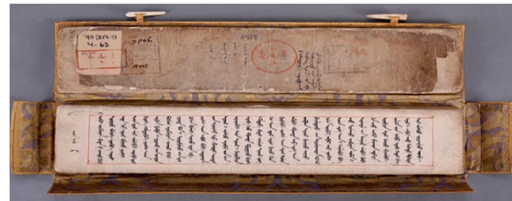
Figure 1.5 "A History of Asragch", Mongolia's unique historical and cultural manuscript