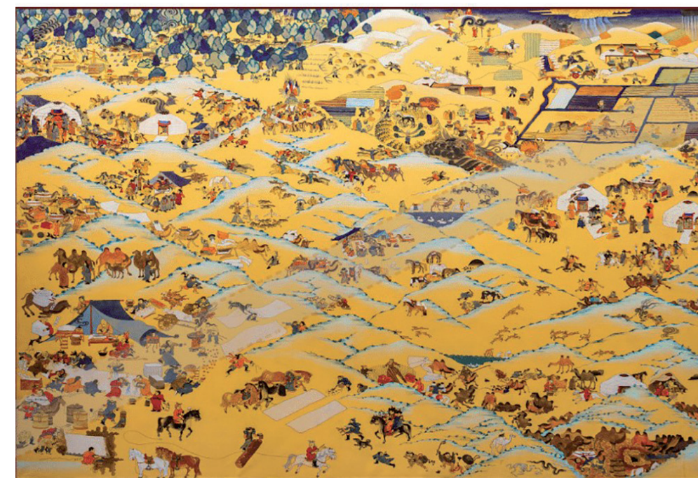
Figure 1.4 B.Sharav, "One Day in Mongolia"