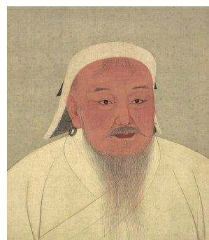
Figure 1.1 Chinggis Khan's Portrait

OBJECTIVE 1.1. Foster and strengthen national pride, patriotism, and unity through the traditions of the statehood, history, cultural monuments, literature and works of art.