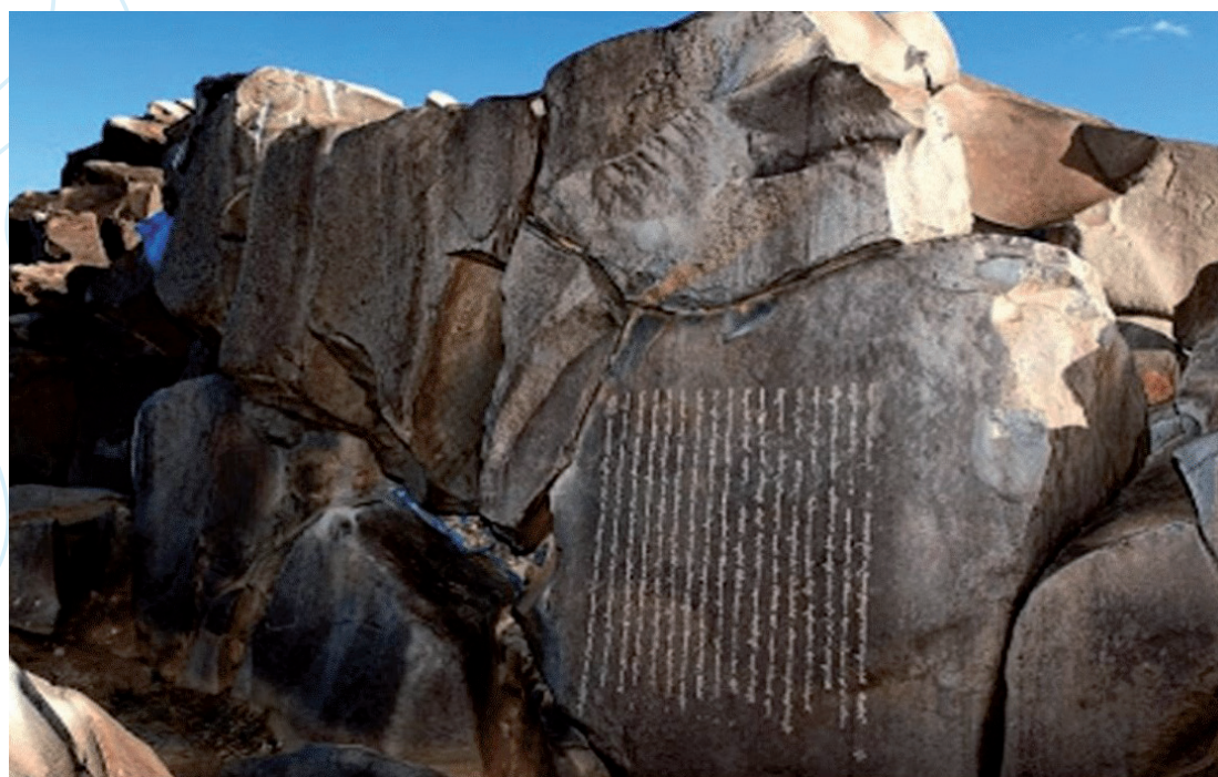
Figure 1.6 Tsogt Taij's "Duutyn Khad" (Rock Inscription of Prince Tsogt)

1.3.10. Implement the "Mongolian Script III" national program.