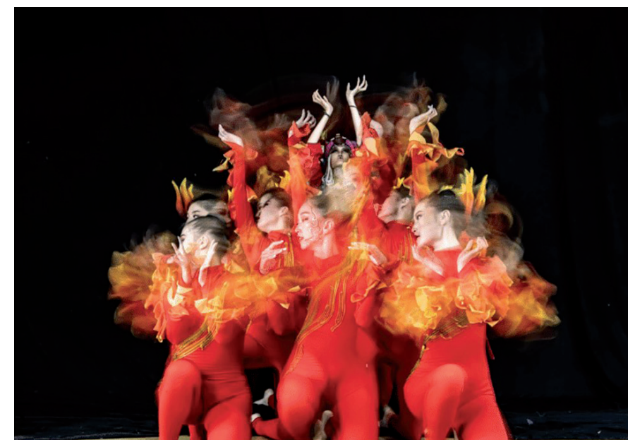
Figure 1.9 Ethnic Ballet "Inverted Triangle"